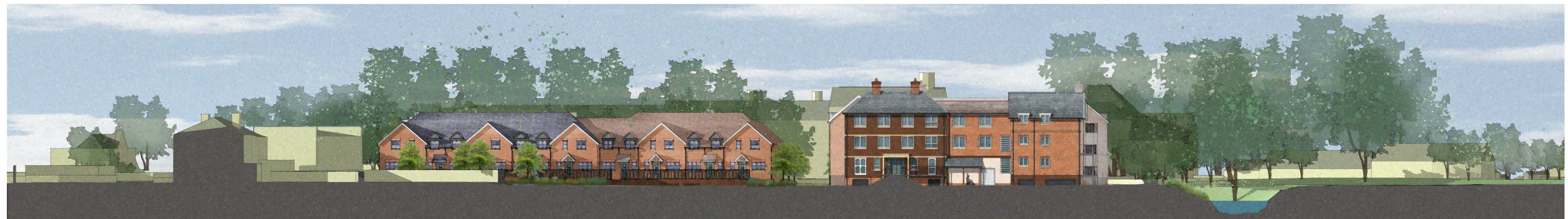
North Elevation/ Section